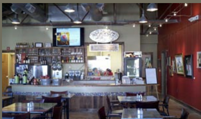
Café open for dinner before theatre events

Theatre scheduling is subject to change. Please check website for updates.