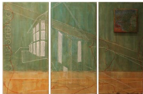
Work by Patricia Steele Raible

The multi-layered surfaces of Raible's work are created and painted using wooden cradles instead of gallery-wrapped canvas, and joint compound instead of gesso to build more luxurious textures and deeper layers. A portion is covered with glazes and images. Often a portion is then sanded away and another layer is added until the entire surface tells the story.