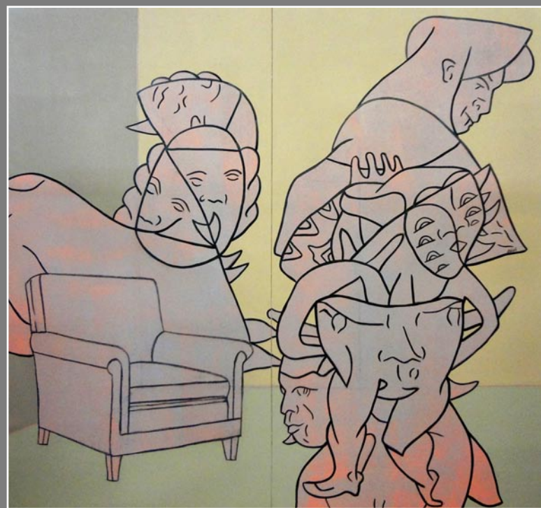
Together With Moths, 2009