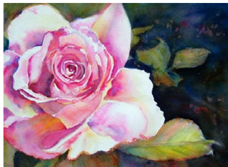
Work by Debbie Grogen

For further information check our SC Institutional Gallery listings, call the City at 843/740-5854 or visit ( www.northcharleston.org ).