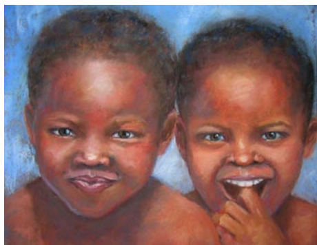
Work by Laura Cody

These female artists all live or lived here