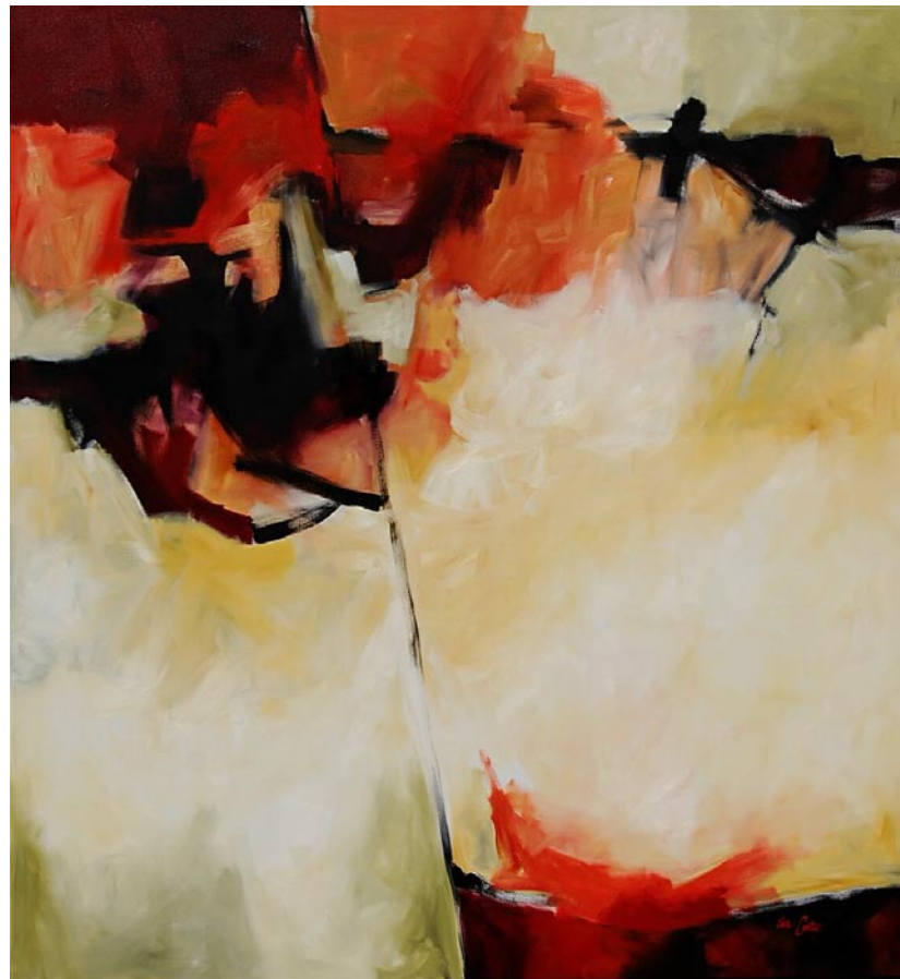
Fracture Oil on Canvas, 72 x 66 inches