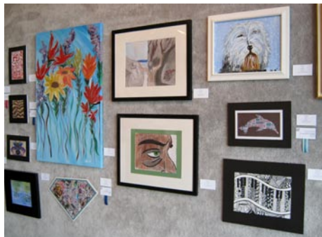
A view of last year's show.

Art Departments of all schools - public,