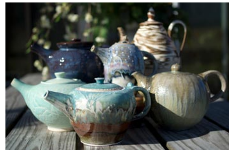
Tea Pots from four SEagrove Potteries