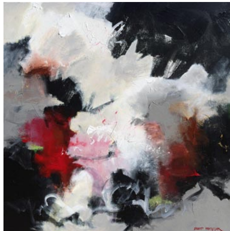
Work by David M. Kessler

Kessler has this to say about the exhibition, "The paintings in the show all began with marks applied to the canvas with black paint in an effort to generate a composition. Then as I begin to apply the color the 'Conversation' begins. How do I treat the black marks? Do I leave them as-is? Do I cover them? Do I use washes across them so they are semi-visible? Should the paint be transparent? Opaque? Thus the conversation back and forth until each piece is complete."