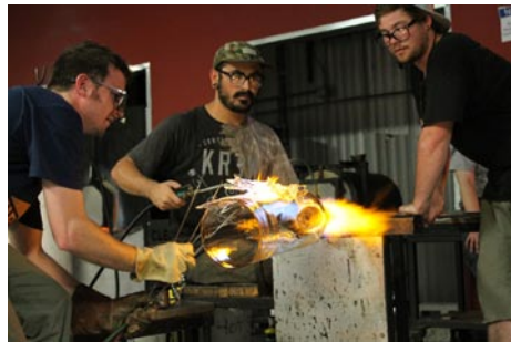
From Hot Glass Cold Beer

is $5, with children 12 and younger admitted free. Admission includes slide shows, demonstrations, finale events, live music, a sculpture workshop led by Gentithes and more. Open studios and workshops require additional fees. Locally-brewed beer and food available for purchase.