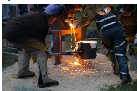
Artists from Liberty Arts of Durham will lead the iron pour at Firefest