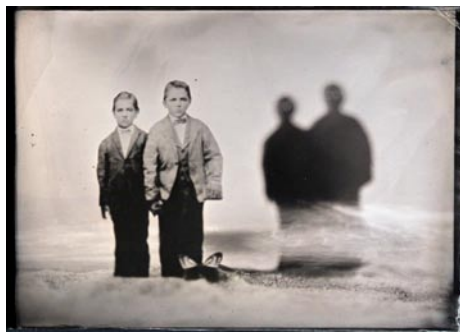
"Metamorphosis" by Christine Eadie

Employing photographic processes from the past, such as tintype, cyanotype, platinum, and gum bichromate printing, all the artists in this exhibition create unique handmade photographic objects. Relying on 21st century technology and 19th century techniques, these contem-