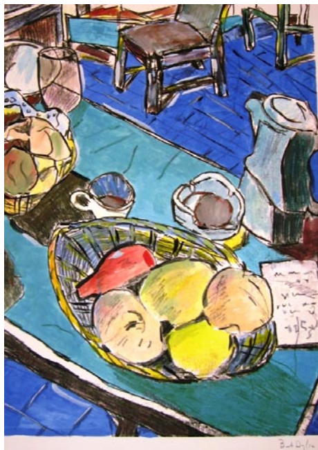
"Still Life with Peaches" by Bob Dylan