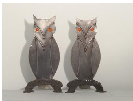
Works by Marty Klaper

For further information check our SC Institutional Gallery listings or visit ( www.coastaldiscovery.org ).