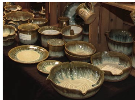
Works from Triple C Pottery

For further information check our NC Institutional Gallery listings, call 828/322-3943 or visit ( www.catawbavalleypotteryfestival.org ).