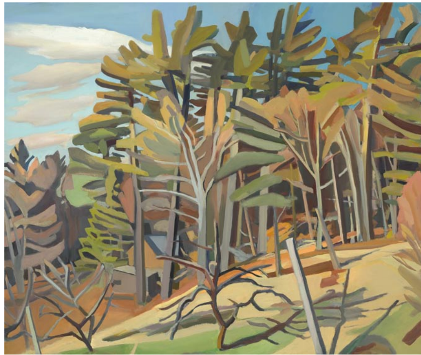
Providence Farm II 54" x 64" oil on canvas

Armstrong's unique painting style has brought her recognition as one of America's leading contemporary artists.