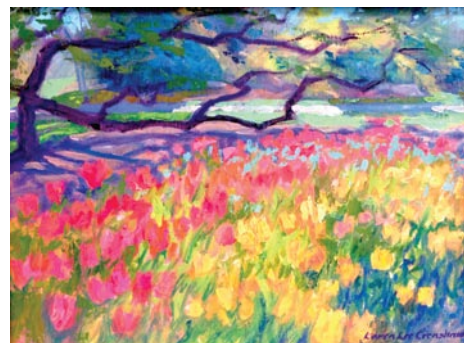
Work by Karen Crenshaw

The talents and hands of our local medical community are not only providing us with excellent care, but they also are the hands that provide us with wonderful artistic creations. Members of the medical