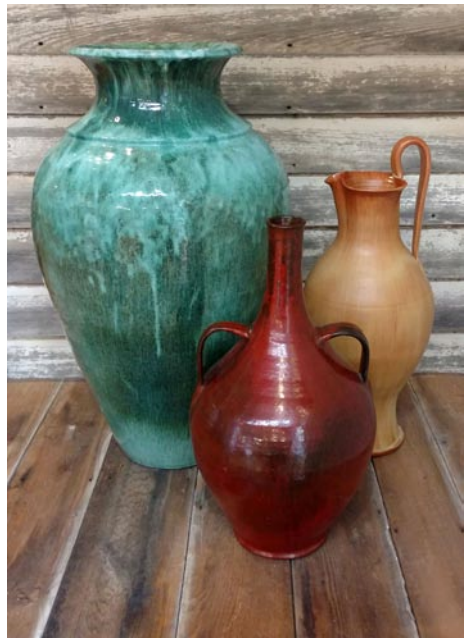
(L to R) large floor vase - attributed to Waymon Cole; two-handled bottle-neck floor vase - attributed to Waymon Cole; and large butterscotch Rebecca pitcher - attributed to Thurston Cole.

Seagrove Area Pottery Center (Not the NC Pottery Center) , 122 E. Main St., Seagrove. Ongoing - The former museum organization was founded twenty-five years ago in Seagrove, and is dedicated to preserving and perpetuating the pottery tradition. We strive to impart to new generations the history of traditional pottery and an appreciation for its simple and elegant beauty. A display of area pottery is now offered in the old Seagrove grocery building. Hours: Mon.-Sat., 9:30am-3:30pm. Contact: 336/873-7887.