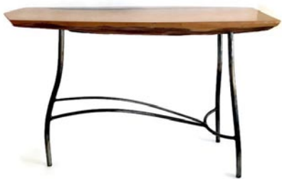
Work by Steven Zatowski

For further info check our NC Institutional Gallery listings, call the Council at 252/638-2577 or visit ( www.cravenarts.org ).