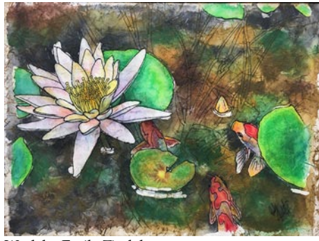
Work by Emily Tindal

Institutional Gallery listings or visit ( https://hartsvillemuseum.org ). For more info about GSSM, e-mail to Patz Fowle at ( fowle@gssm.k12.sc.us ) or visit ( www.scgssm.org ).