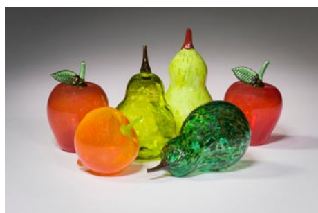
Glass fruit from the STARworks glass 2020 line