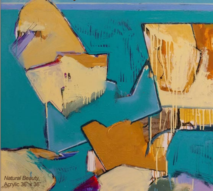
Natural Beauty Acrylic 36" x 36"