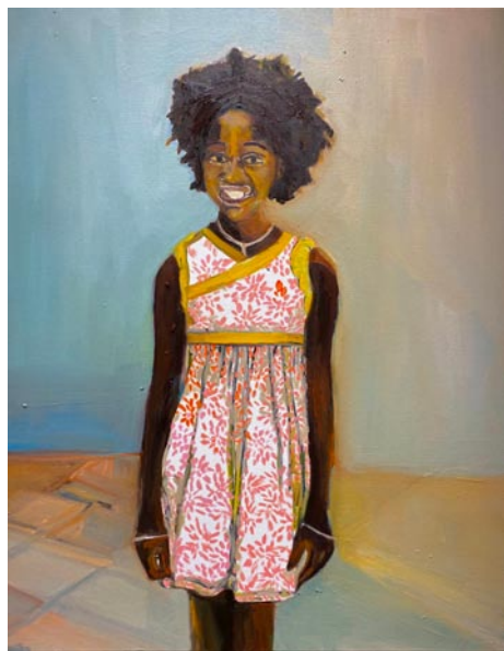
Work by Beverly McIver

For further information check our NC Commercial Gallery listings, call the gallery at 919/286-4837 or visit ( www.cravenallengallery.com ).