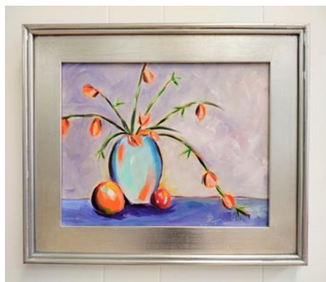
Work by Lynn Goldhammer

continued above on next column to the right