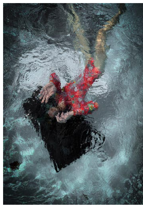
Work by Barbara Tyroler

The over 11,000-square-foot gallery includes a large exhibit space, three state-of-the-art classrooms, a hands-on children's area and a gift shop. Hands-on instruction in a wide variety of media will be offered including acrylic and oil painting, watercolor, collage, drawing, ceramics, glass fusion and light metal working classes.