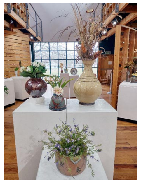
View of "Flower Power II" exhibition

The North Carolina Pottery Center is a dynamic and engaging place where people of all backgrounds, ages, and interests discover