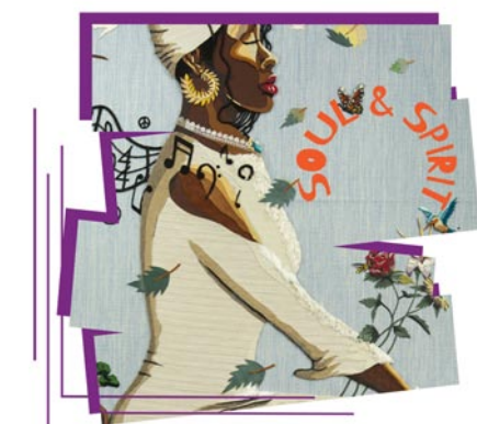
Work by Don DonCee Coulter

"Arts Council's support for this national