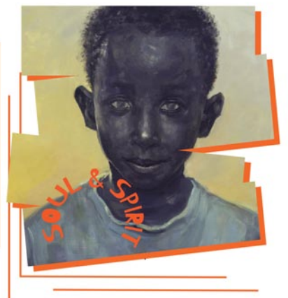
Work by Tyrone Geter

The Arts Council of Fayetteville | Cumberland County is a tax-exempt 501(c)(3) organization based in Fayetteville, NC that supports individual creativity, cultural preservation, economic development, and