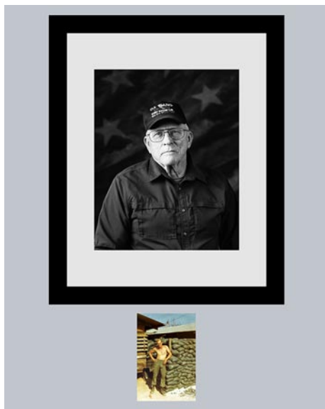
Work by Tom McCabe

For further information check our NC Institutional Gallery listings, call the Council at 252/638-2577 or visit ( www.cravenarts.org ).