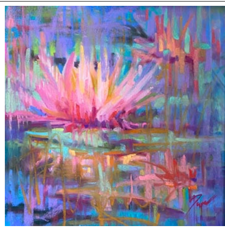
Tammy Papa, Dreaming of Waterlilies , Pastel on Uart, 16x16 inches