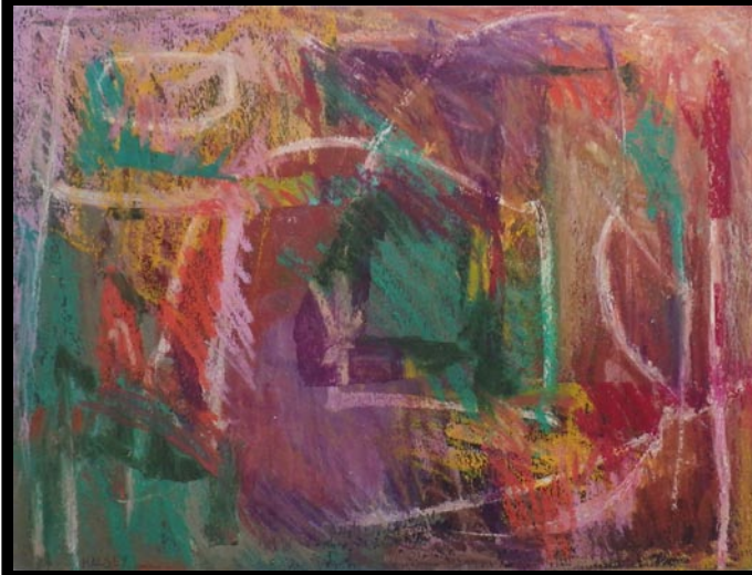
Growing by William Halsey, 1992 oil pastel and paint stick on paper, 18 x 24 inches

Paintings Graphics & Sculpture for the discerning collector