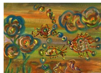
"Blowing Bubbles with the Flowers"

Aprons • Stickers • Children's Paint Smocks