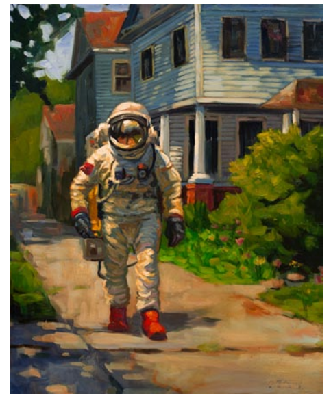
Work by Bryant Portwood

African American Atelier & Bennett College for Women Gallery , Greensboro Cultural Center, 200 N. Davie Street, Greensboro. Ongoing - Featuring works by local, regional and national African American artists. Hours: Tue.-Sat., 10am-5pm; Wed., till 7pm & Sun., 2-5pm. Contact: 336/333-6885.