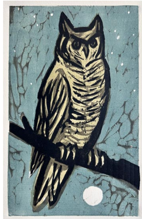
Work by Kent Ambler

Aesthetic Gallery , 6 College St., across from Pritchard Park, Asheville. Ongoing - Offering a variety of international works, including terracotta ceramics from Viet Nam and stone sculpture from Zimbabwe. In addition, there is an assortment of intricately detailed hand-crafted pictorial textiles from Australia and Lesotho, many of which depict local Asheville scenes. Also available are Australian Aboriginal oil paintings, Bruni Sablan oil paintings from the "Jazz Masters Series," and ceramic tiles from the Southwest (US). Hours: Tue-Sat, noon-6pm. Contact: 828/301-0391 or at ( www.aestheticgallery.com ).