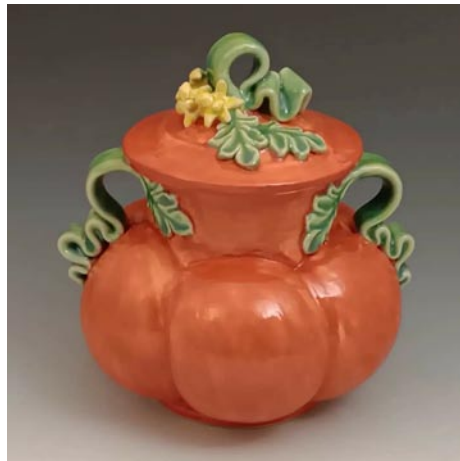
Work from Turtle Island Pottery

Turtle Island Pottery , 2782 Bat Cave Road, Old Fort. Ongoing - Featuring handmade pottery by Maggie and Freeman Jones, who create one of a kind, functional, decorative stoneware items. From cups to umbrella stands, mirror frames and clocks. Sculptural and inspired by nature, many forms are reminiscent of antique pottery from the arts and crafts movement and art nouveau styles. Hours: Showroom open most Saturdays, call ahead for any day of the week. Contact: 828/669-2713 or at ( www.turtleislandpottery.com ).