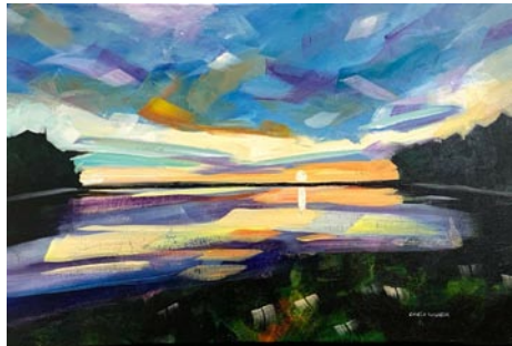
Work by Chris Wagner

Carolina Creations Fine Art and Contemporary Craft Gallery , 317-A Pollock Street, New Bern. NC. Ongoing - Featuring fine art and contemporary crafts including pottery, paintings, glass, sculpture, and wood by over 300 of the countries top artists. Hours: Mon.-Sat., 10am-6pm, & Sun., 11am-3pm. Contact: 252/633-4369 or at ( www.carolinacreations.com ).