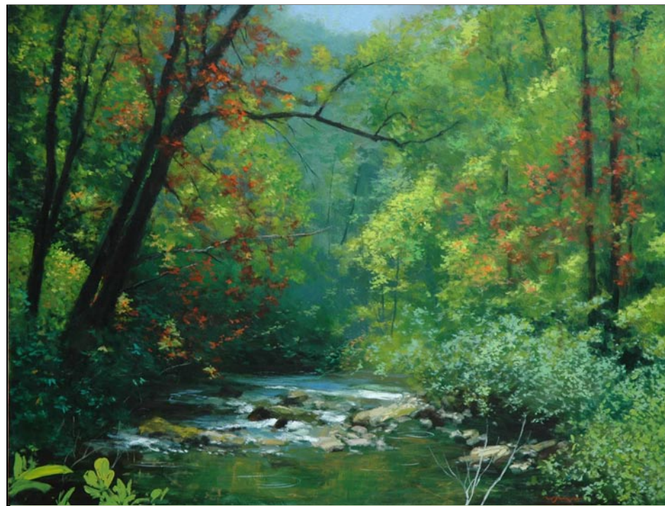
Late Summer on the Chattooga River