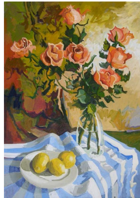
Work by Joseph Cave

For further information check our SC Commercial Gallery listings, call the gallery at 843/979-0149 or visit ( www.cherylnewbygallery.com ).