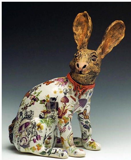
Work by Carol Gentithes

Each shop is celebrating Spring in its own way. Hours may differ from shop to shop.