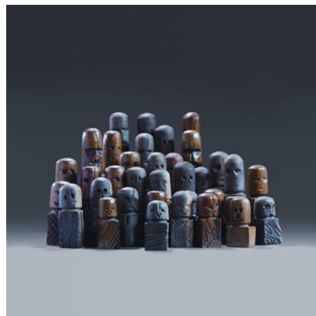
El Anatsui, Group Photo , 1987, wood, dimensions variable

Anatsui currently lives and works in Nigeria. He is recognized as one of the most original and compelling artists of his generation.