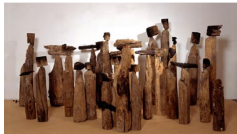
El Anatsui, Akua's Surviving Children , 1996, wood and metal, dimensions variable

The exhibition traces the prolific career of El Anatsui - one of contemporary art's most celebrated practitioners—from his early woodwork in Ghana to today's metal wall sculptures created in his studio in Nigeria, offering an unprecedented chance for visitors to follow the artist's creative development over 40 years.