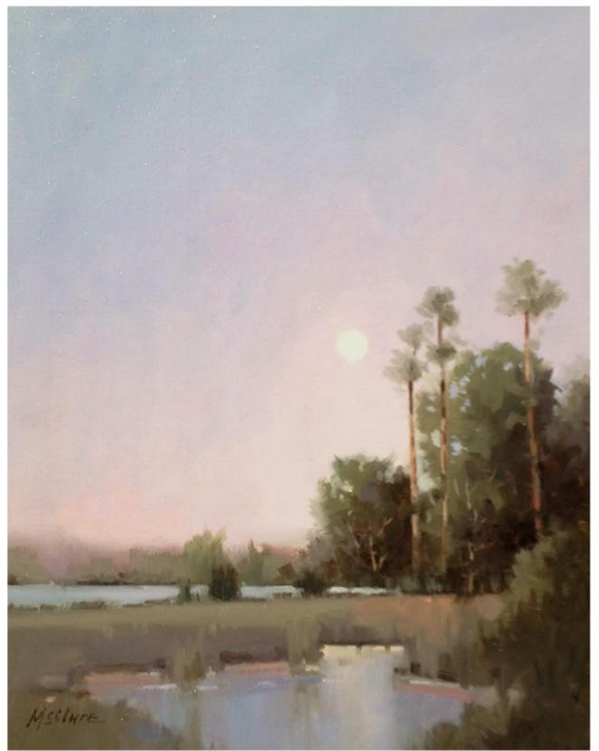
FEATURING RICK MCCLURE FOR THE MONTH OF APRIL LUMINOUS, 20x16