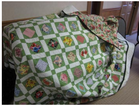
A Walk in the Garden quilt

Using the pattern created by the local quilters, and their own fabric, the Island Quilt members pieced over 140 floral blocks that were used in the quilt. At a guild meeting and at Marsha Korpanty's house, The Island Quilters pieced the