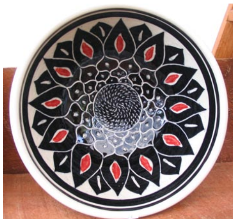
Work by Cindy Trisler

Pope is drawn to weathered surfaces altered by nature's corrosion and appreciates the challenge of reflecting what he calls visual acoustics. He is captivated by how the elements, over time, alter things into an expression of life by decay and