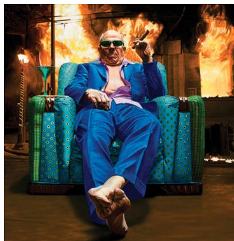
Work by Ira Upin

For further information check our NC Commercial Gallery listings, call the gallery at 919/833-1415 or visit ( http://www.enogallery.net/ ).