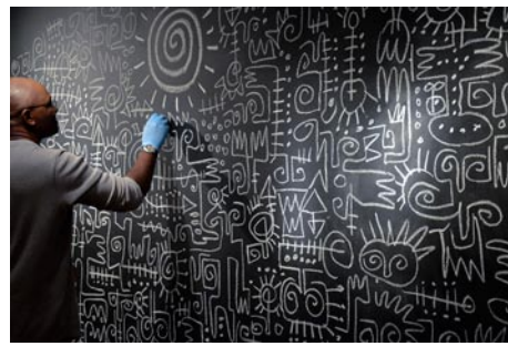
Work by Victor Ekpuk

Appalachian Cultural Museum , University Hall Drive, off Hwy. 321 (Blowing Rock Road), Boone. Ongoing - The permanent exhibit area includes, TIME AND CHANGE, featuring thousands of objects ranging from fossils to Winston Cup race cars to the Yellow Brick Road, a section of the now closed theme park, "The Land of Oz". Admission: Yes. Hours: Tue.-Sat., 10am-5pm & Sun., 1-5pm. Contact: 828/262-3117.