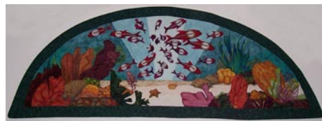
Work by Stephanie Wilds

Black Mountain Center for the Arts , Old City Hall, 225 West State St., Black Mountain. Upper Gallery, Apr. 13 - 26 - Featuring an exhibit of quilts by Stephanie Wilds in conjunction with the Swannanoa Valley Museum for its 2013 opening. Hours: Mon.-Wed., 10am-5pm; Thur. 11am-3pm; Fri., 10am-5pm. Contact: 828/669-0930 or at ( www.blackmountainarts.org ).