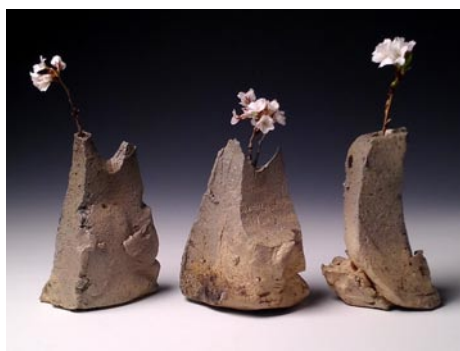
Works by Warner Hyde

Hyde was selected to participate in "SteinFest," an exhibition by six North American artists who were invited to make and exhibit modern interpretations of the