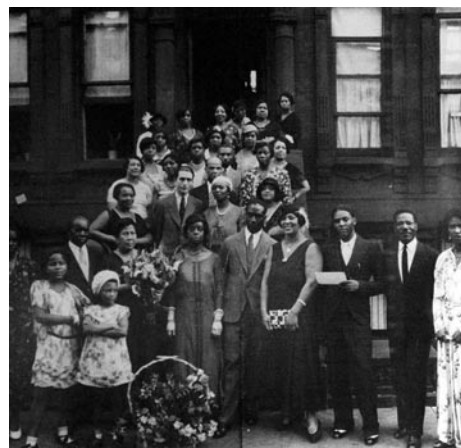
Family Group Outside Brownstone, 1920s'.

Beaufort Art Association Gallery , 913 Bay Street, across the street from the Clock Tower, Beaufort. Ongoing - New works by more than 90 exhibiting members of the Beaufort Art Association Gallery - exhibits and featured artists change every six weeks. In addition to framed paintings in a variety of media, the gallery offers prints, photographs, unframed matted originals, jewelry, sculpture, ceramics and greeting cards. Hours: Mon.-Fri., 10 am-5pm. Contact: 843/521-4444 or at ( www.beaufortartassociation.com ).