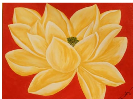
Work by Dusty Connor

The nucleus separated with a single photograph that took on a double life as