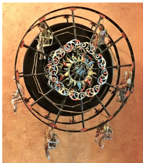
Work by Nancy Mitchell

Always eclectic there are several relief sculptures of the carnival landscape in-