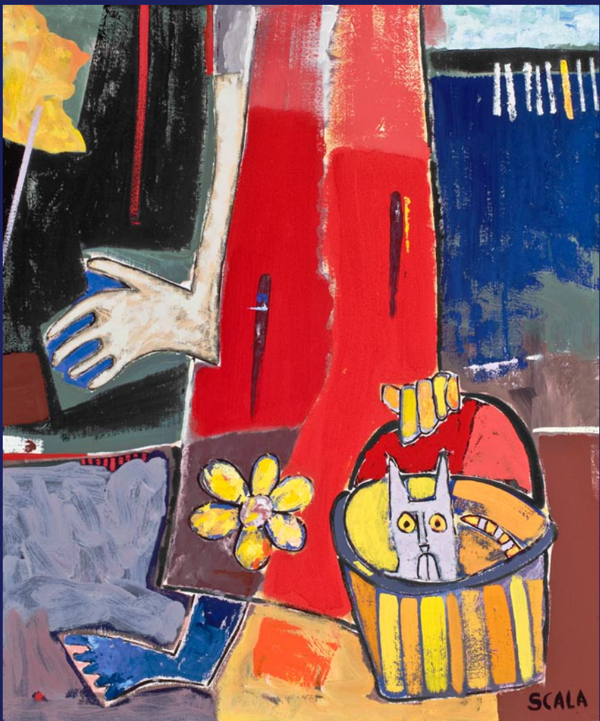
"Fancy Dress in Weather" oil on linen 24 x 20 inches