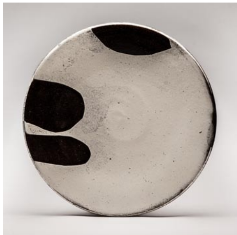
Work by Lindsay Rogers

What does it mean to inhabit close quarters with another person? Especially in the arena of domestic life, the act of sharing a small space is often an interpersonal exercise in balance. The give and take of collaborative decision-making becomes a rhythmic dance that occurs between people and the objects that represent them. Eventually, color, pattern, texture and form blend within the space to reflect the relationship of those that occupy it.