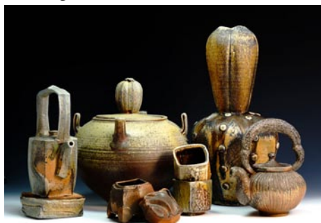
Works by Jason Bohnert

From the technical side, the clay pieces are altered wheel-thrown forms, slab to press molded constructions, and fired in multiple ways such as in raku, sawdust, horsehair, low-temperature salt, and oxidation... all of which are in the low temperature range of c/06-c/02.