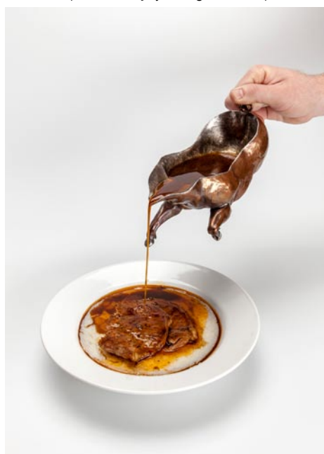
Work by Logan Woodle

Edgefield and Greenwood Counties, May 2 - 3, 2015 - "4th annual Heritage Trail Pottery Tour & Sale". Visit 5 pottery studios (over 20 potters) in Edgefield and Greenwood counties and the Groundhog kiln opening in Edgefield. The tour is sponsored by the Greenwood Area Studio Potters (GASP), a group which was formed by current and former students of the professional pottery program at the Edgefield campus of Piedmont Technical College. For a detailed schedule of events or to receive the official Heritage Trail Pottery Tour brochure visit ( www.facebook.com/HeritageTrailPotteryTourSale ) or e-mail to ( bellhousepottery@gmail.com ). Greenwood and Edgefield counties are both located along the SC National Heritage Corridor. Hours: Sat., 10am-5pm & Sun., noon-5pm. Contact: Dohnna Boyajian at 864/554-0336 or e-mail to ( dcollinsboyajian@gmail.com ).