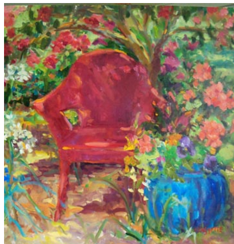
Work by Sandra Baggette

Coastal Discovery Museum at Honey Horn , off Highway 278, across from Gumtree Road, Hilton Head Island. Museum Grounds, Apr. 25 & 26, 2015 - "13th Annual Juried Fine Art and Craft Show". The Art Market at Historic Honey Horn is a juried fine art and craft outdoor festival. Featuring works in clay, wood, fibers, metals, glass, jewelry, watercolors, oil, mixed media and photography will be on display and for sale. The event will host nearly 100 artists from as far away as Seattle's Pike Place Market, Wisconsin and well-known local artists as they share the spotlight during this weekend-long event. Each artist will compete for prizes up to $5,000. Demonstrations will be held throughout the weekend. Food and beverages will be available for sale during the event. There is a $6 per car parking donation. Hours: Sat., 10am-5pm and Sun., 11am-4pm. Contact: 843-689-6767 ext. 224 or at ( www.coastaldiscovery.org ).