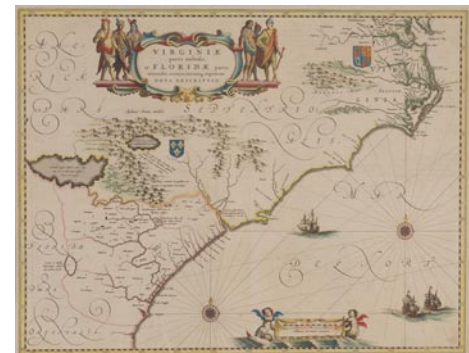
Work from The Bishop Collection of Antique Maps