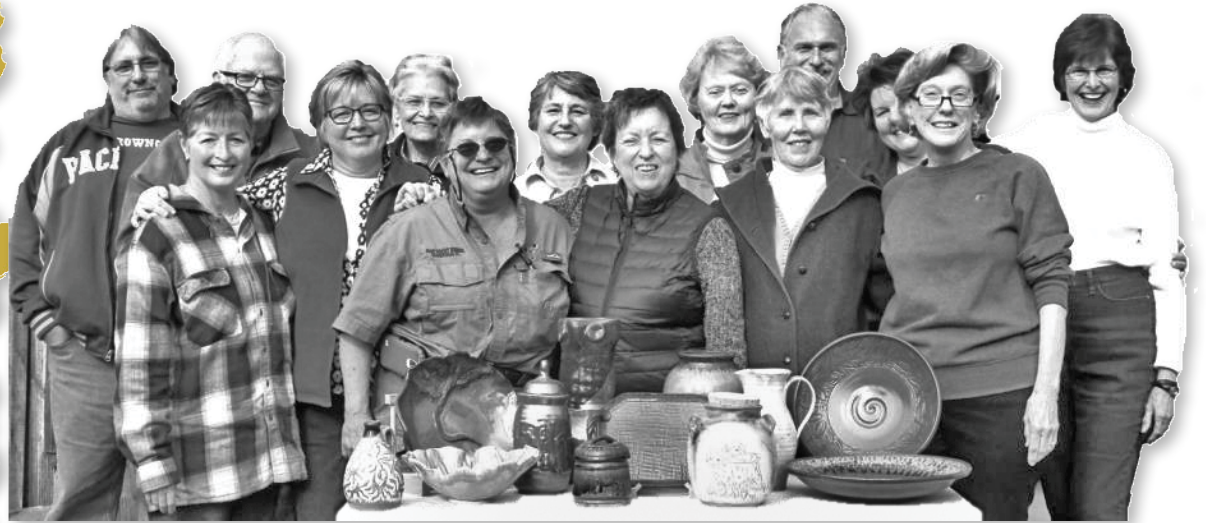
Greenwood Area Studio Potters support Empty Bowls each year in October, benefiting Greenwood Soup Kitchen.

Bell House Pottery The Clay Works Old Edgefield Pottery pARTners in Clay PK Pottery