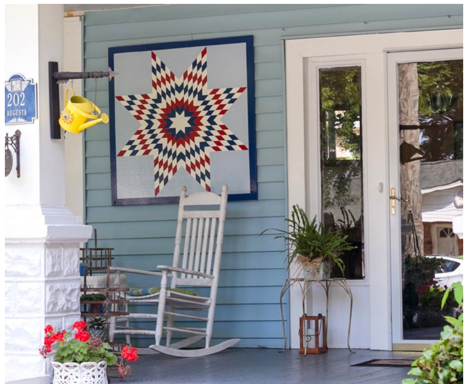
#98 Texas Star, 202 Augusta Street, Westminster, S.C.

For further info check our SC Institutional Gallery listings or call 864/388-8810.