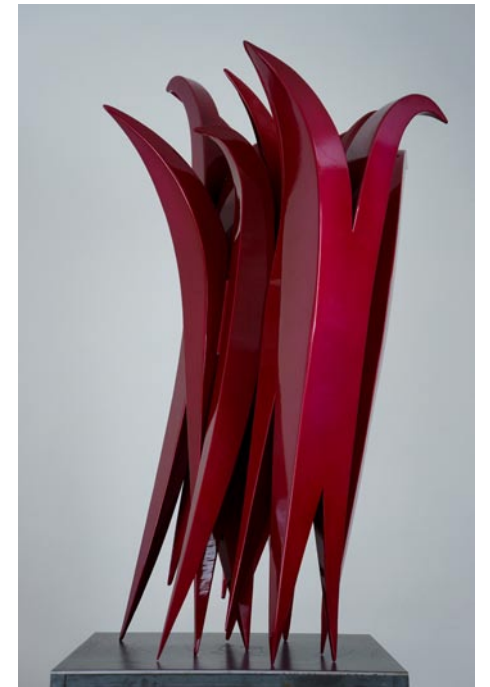
"Fiddle," by Shaun Cassidy

era from over 15 artists, activists, and archives nationwide, this exhibition considers 'craft' in an expanded sense to include such practices as homeopathy, scrapbooking, gardening, and other do-it-yourself (DIY) strategies for self-reliance. For further information call the Center at 828/785-1357 or visit ( www.craftcreativitydesign.org ).