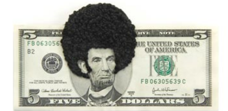
Work by Sonya Clark

The Columbia Museum of Art in Columbia, SC, is presenting Charles Courtney Curran: Seeking the Ideal , the first-ever museum retrospective of this treasured American painter, on view through May 17, 2015. Charles Curran's heart was claimed by women, children and flowers, and he devoted a lifetime to painting them in the full light of day out of doors. The exhibition brings together 58 Curran masterpieces sure to astonish with their jewel-like color, soaring vistas and garden landscapes, and love for beauty. For further information call the Museum at 803/799-2810 or visit ( www.columbiamuseum.org ).