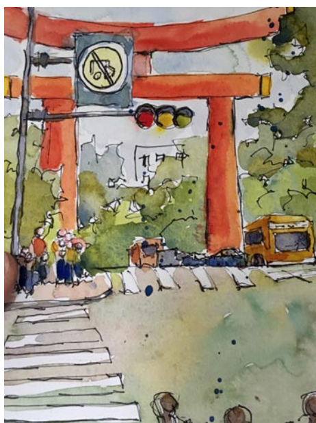
Work by Virginia Pendergrass

"Charles Reid also makes life easy for the so-so watercolorist. His watercolors are famous for uncorrected blobs, blooms, drips, and spontaneous drifting and mixing of colors at edges. He advises students to