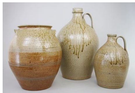
Salt glaze pots from Jugtown Pottery