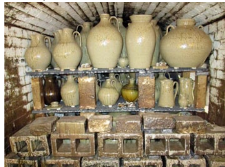
View inside Jugtown Pottery kiln