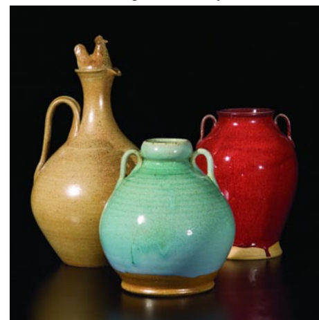
Works from Jugtown Pottery