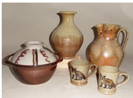
Jugtown Pottery works from 2017