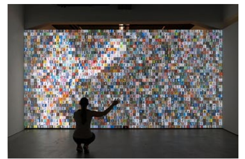
Installation by Rafael Lozano-Hemmer

The North Carolina Museum of Art's permanent collection spans more than 5,000 years, from ancient Egypt to the present, making the institution one of the premier art museums in the South. The Museum's collection provides educational, aesthetic, intellectual, and cultural experiences for the citizens of North Carolina and beyond. The 164-acre Museum Park showcases the connection between art and nature through site-specific works of environmental art. The Museum offers changing national touring exhibitions, classes, lectures, family activities, films,