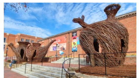
Works by Patrick Dougherty

an icon of nurture. In multiple media, she morphs and transforms that icon from recognizable to abstract and back again. Each iteration employs the motif inventively to create images by turns poignant, witty, and irreverent. For further information call the Museum at 336/334-5770 or e-mail to ( weatherspoon@uncg.edu ).