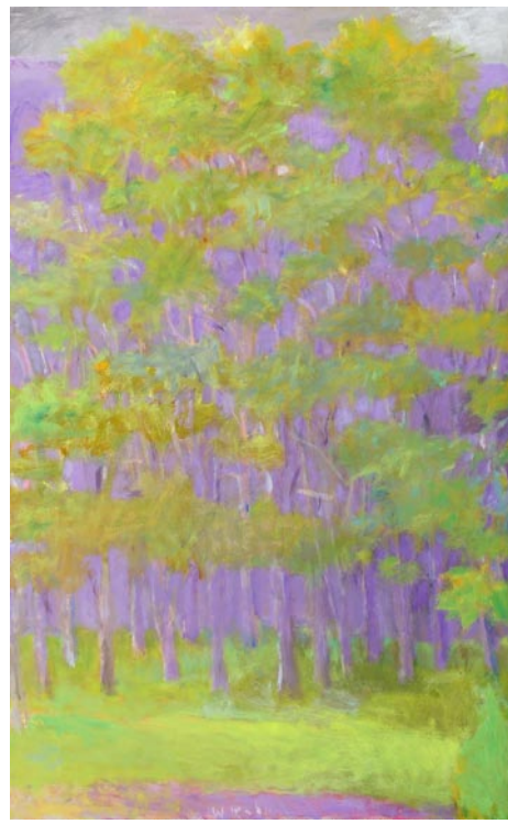
Work by Wolf Kahn at Jerald Melberg Gallery

continued above on next column to the right