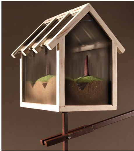
Work by Jonathan Pellitteri

"The quasi-architectural/ mechanical appearance of my sculptures combine archaic construction methods with modern techniques and materials, in an effort to demonstrate my appreciation for the immediacy of antiquated technology, as I do my best to embrace the advancements of today," adds