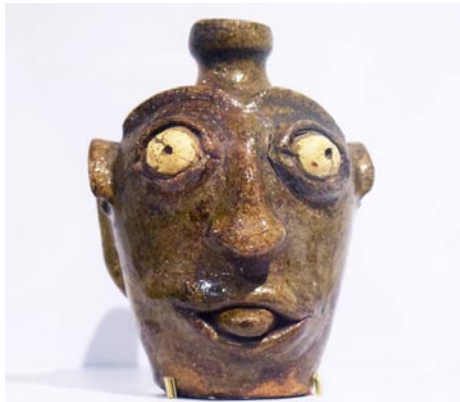
Face Vessel, c. 1840 - 1850, by Landrum Pottery in Horse Creek, SC, Thumb 1024 x 619