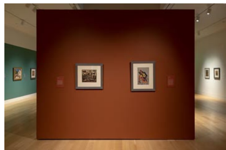
View of "Kindred Spirit" Exhibition

For further information check our SC Institutional Gallery listings, call the Museum at 843/676-1200 or visit ( www.flocmuseum.org ).