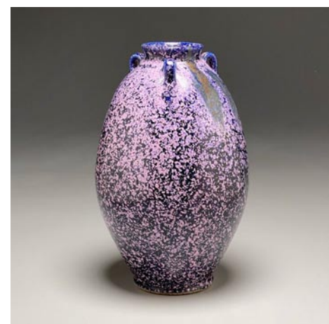
Work by Ben Owen III

Throughout the Seagrove area, Apr. 16 - 18, 2021 - "13th Annual Celebration of Seagrove Potters Spring Pottery Tour & Kiln Openings". Over 50 Seagrove Potteries offering special events, kiln openings, studio tours, pottery sales, and demonstrations. The annual "Celebration of Spring in Seagrove" is a self-guided tour of individual pottery galleries, studios and workshops. It is held at participating shops located from the downtown city center and throughout the country side. Over 55 local potters will host kiln openings, studio tours, demonstrations. Spring has always been a time for renewal and awakening in Seagrove and this year an unprecedented number of