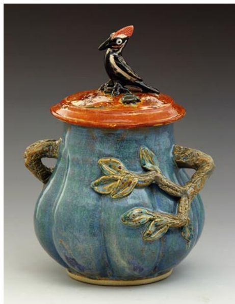
Work from Turtle Island Pottery

Turtle Island Pottery , 2782 Bat Cave Road, Old Fort. Now - Turtle Island Pottery Maggie and Freeman Jones. Best place for info about our work is the website at ( http://Turtleislandpottery.com/ ) sign up for our newsletter too. Best contact is e-mail or phone...on the website. Ongoing - Featuring handmade pottery by Maggie and Freeman Jones, who create one of a kind, functional, decorative stoneware items. From cups to umbrella stands, mirror frames and clocks. Sculptural and inspired by nature, many forms are reminiscent of antique pottery from the arts and crafts movement and art nouveau styles. Hours: Showroom open most Saturdays, call ahead for any day of the week. Contact: 828/669-2713 or at ( www.Turtleislandpottery.com ).