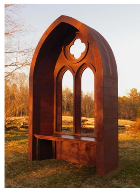
Work by Beau Lyday

The fifteenth annual National Outdoor Sculpture Competition and Exhibition FY21/22 opens Apr. 28 at the stunning North Charleston Riverfront Park, located at the old Navy Base. The 11-month exhibition features 13 pieces by established and emerging artists from 10 states displaying imaginative and thought-provoking outdoor sculpture.