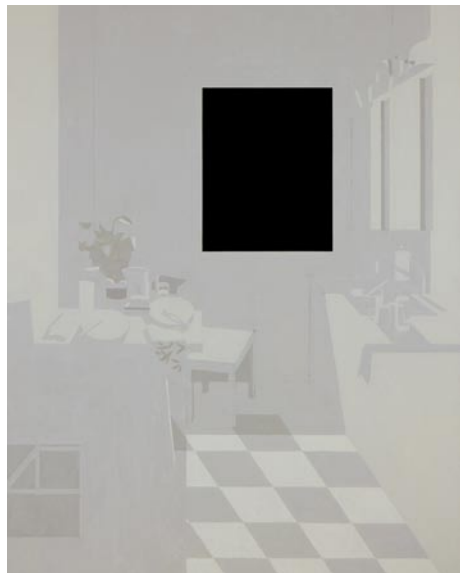
Work by Benny Fountain

Dittenber's quiet works probe the meaning of books beyond the contents inside, reflecting on use and wear, affection and