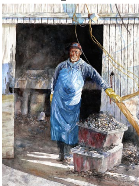
Work by Sandra Roper

This year's Art Market will have works in the following media on site: oil, acrylic, watercolor, mixed media 2-D & 3-D, sculpture, photography, pastel, ceramics,