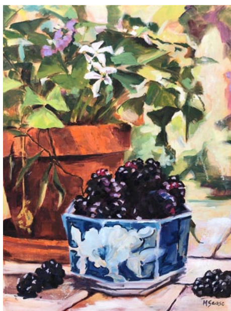
Work by Murray Sease

In addition to selling their original works, artists will also be competing for $5,000 in prizes.